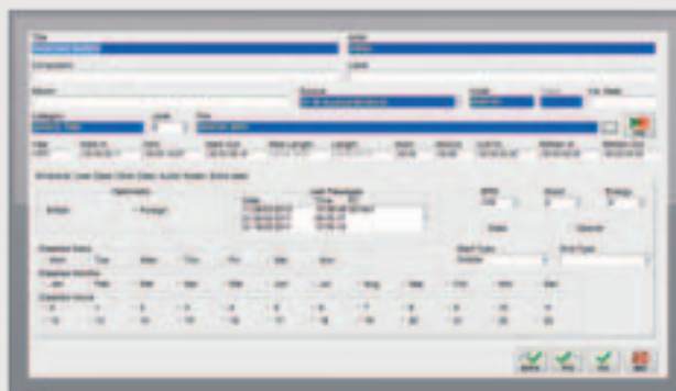
SONG MANAGER MODULE

DJPRO CLASSIC also keeps track of all operations made by the operators in .log files that can be browsed by the administrators.