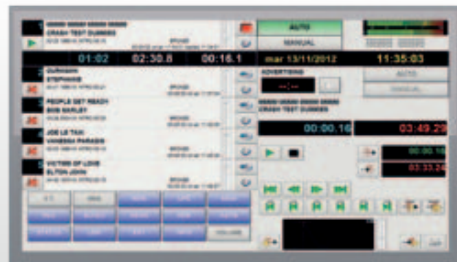
ON AIR MODULE + CUE

All crossfade parameters are set for each single audio resource as songs, jingles, sweepers and prerecorded programs, giving the radio station a different personality and meeting the needs of the music scheduler.